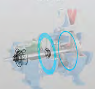
REPAIR KIT Item# 906